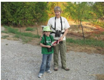
LEARN MORE: Meadow Restoration