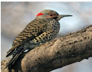
GET INVOLVED: Hops for Habitat

"But now, says the Once-ler, Now that you're here, the word of the Lorax seems perfectly clear. UNLESS someone like you cares a whole awful lot, nothing is going to get better. It's not." -Dr Seuss