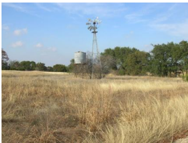
SAVE LAND: Connectivity of Open Spaces