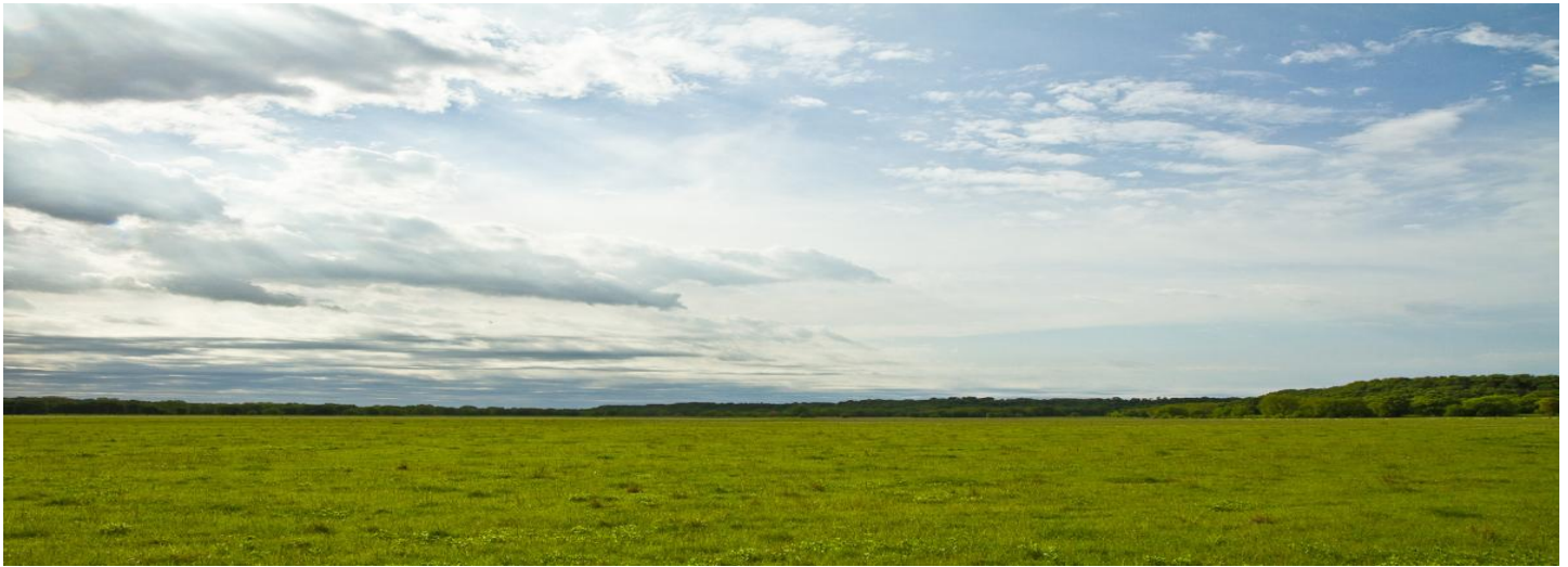
Photo of Leo Ranch